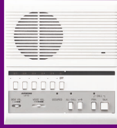
LEF-5 5-call master station.