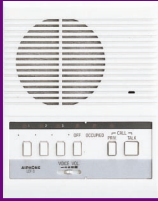
LEF-3 3-call master station.