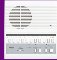
LEF-10S 10-call master station with All Call.