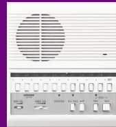
LEF-10 10-call master station.